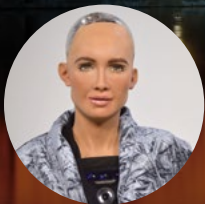
Meet Sophia the Robot, from Hanson Robotics