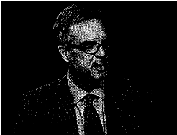
JAMES B. STEWART DISCUSSES TANGLED WEBS ON CHARLIE ROSE (2011)