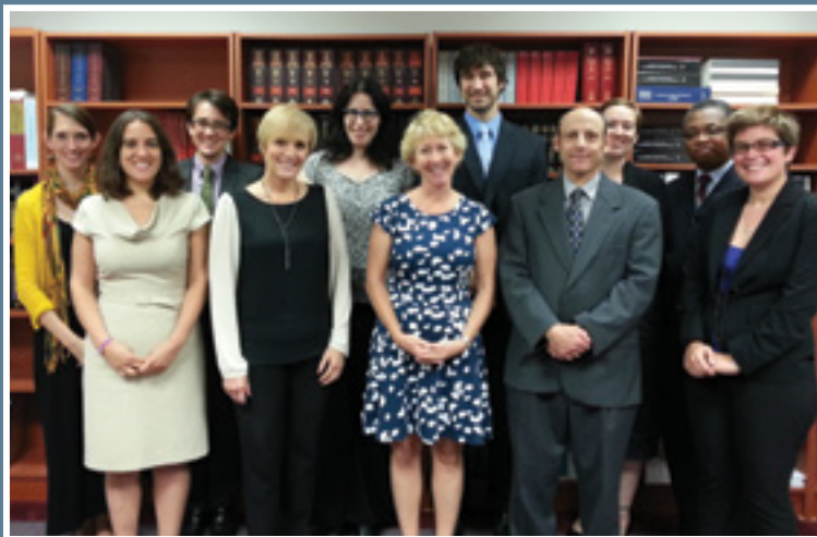
Nonprofit Organization Prisoners' Legal Services of New York Albany, New York

Senior Staff Attorney Empire Justice Center Albany, New York