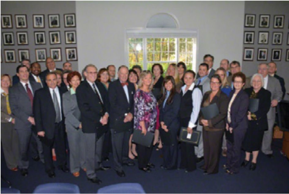
Pro Bono Attorneys honored at 2013 luncheon.