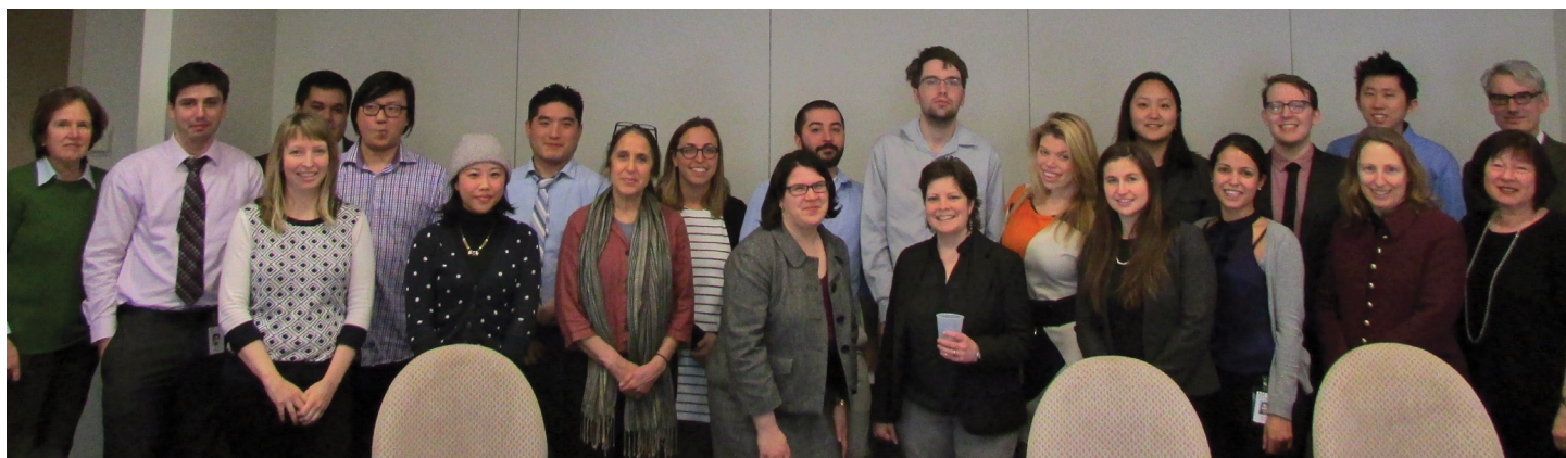
NYLAG Staff and Pro Bono Scholars

ing court documents, and requesting documents from various state agencies. But that first visit to Housing Court remains vivid: