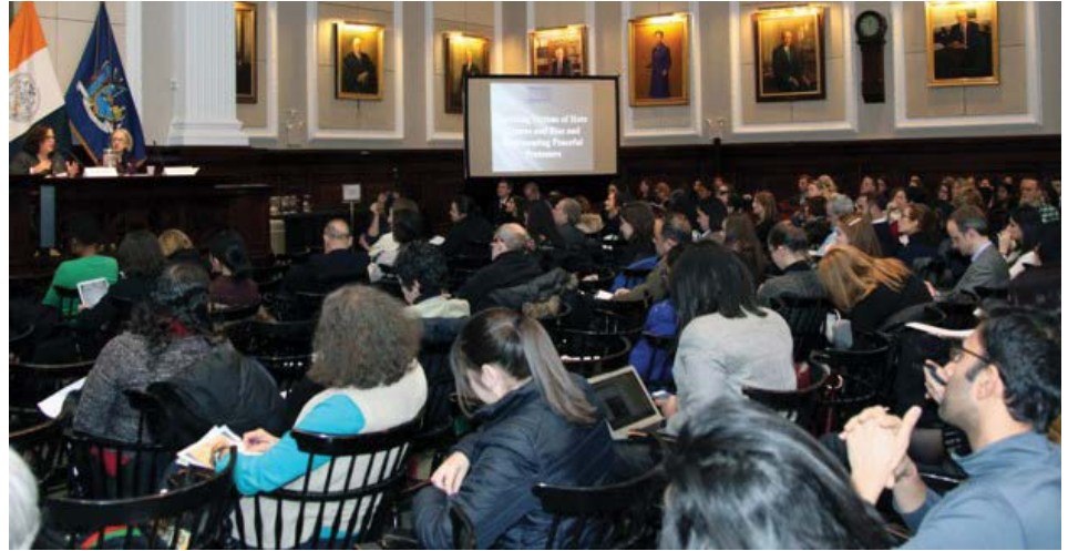
December Training at the New York City Bar Association: Assisting Victims of Hate Crimes & Bias and Representing Peaceful Protesters

In the last four months, approximately two thirds of callers screened by the Justice Center's Anti-Harassment Project identify as female. These