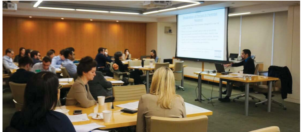
April training on Emergency Preparedness for Immigrant Families at Willkie Farr & Gallagher LLP