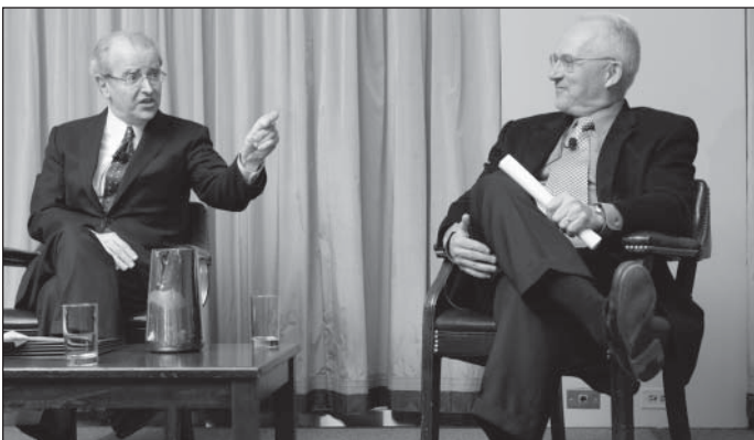
Chief Judge Lippman and Judge Wesley mix it up before a live studio audience