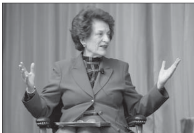
Hon. Judith Kaye channels James Lipton as host of the Judge Kaye Show

in the Appellate Division that require extraordinary productivity and naturally limit the product that comes out, the limited number of commercial cases that reach the Court of Appeals, and the continuing struggle to raise judicial salaries—with robust discussion about ways to address these chal-