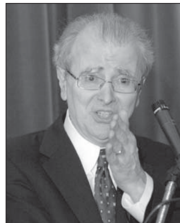
Chief Judge Lippman addresses CFLS luncheon as recipient of the Stanley H. Fuld Award