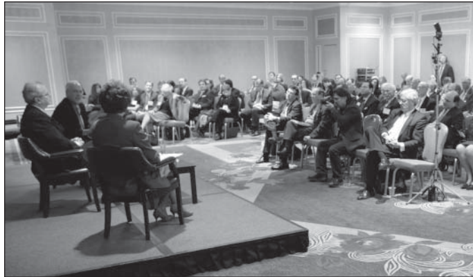
Lights, camera...action! The Judge Kaye Show in full swing