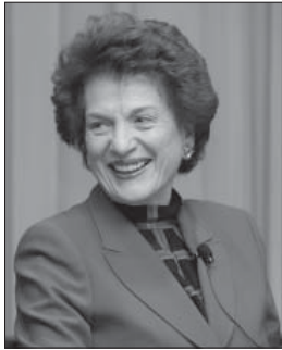
Judge Kaye enjoying her turn as talk show host