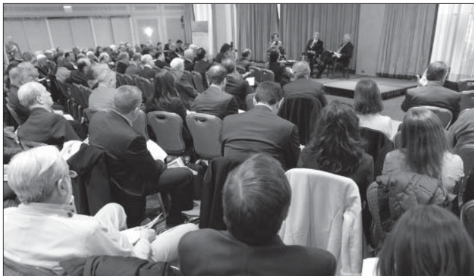
A packed room surrounds the set for the Judge Kaye Show