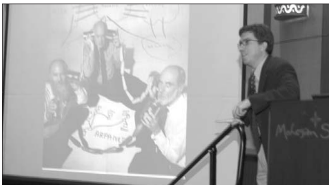
Friday evening's presentation with keynote speaker Professor Jonathan Zittrain of Harvard Law School.

May 21–23, 2004 • Mohegan Sun, Uncasville, CT