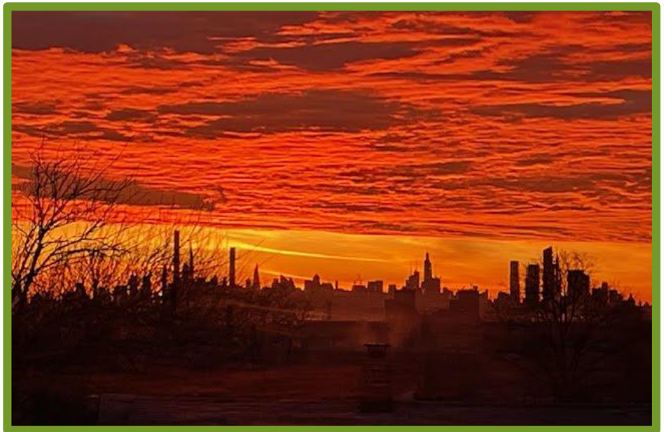
Autumn Sunrise - New York County, New York