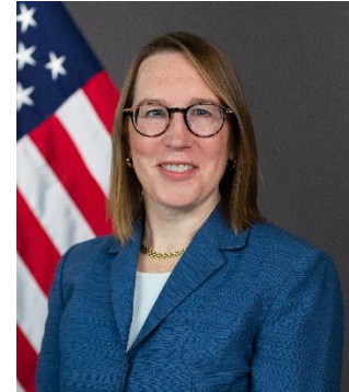
Commissioner Hester M. Peirce U.S. Securities and Exchange Commission (Virtual Appearance)