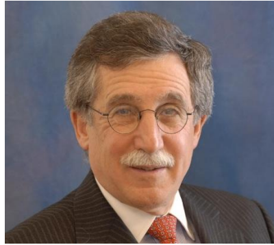
Judge Sidney H. Stein United States District Court, Southern District of New York, U.S.A.