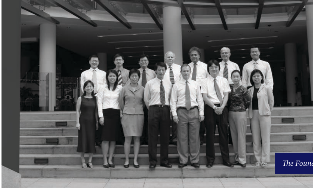
The Founding Years