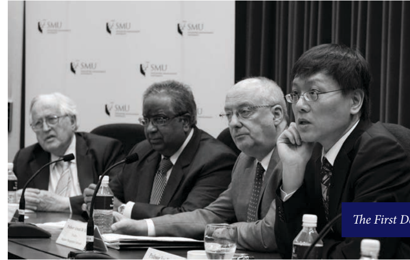
The First Decade