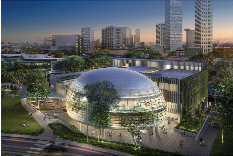
Artist Impression of the School of Law.