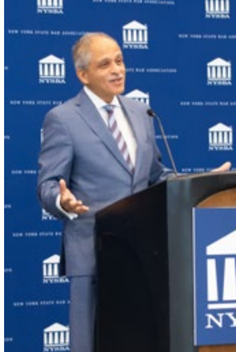
Chief Judge Rowan D. Wilson