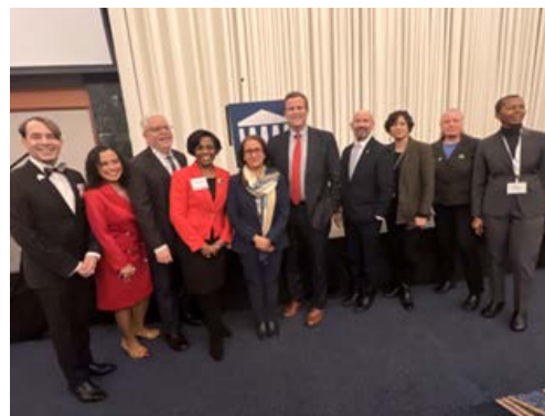
Members of the Court of Claims at the 2025 Judicial Section Luncheon