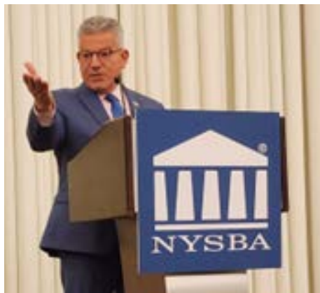
Chief Administrative Judge Hon. Joseph A. Zayas