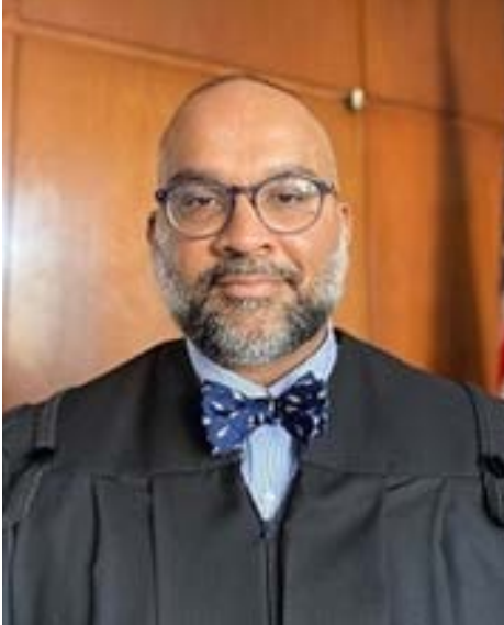
Hon. Shahabuddeen Ally

Administrative Judge, New York City Civil Court