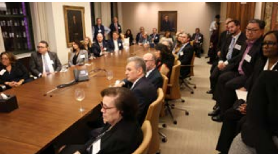
Assembled guests at the New York Bar Foundation's Leadership Laureate event