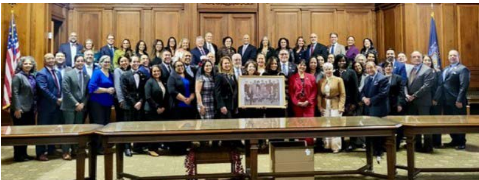
Members of the Latino Judges Association at the Association's annual Three Kings Day Celebration held at the Appellate Division, Second Department on January 10, 2025