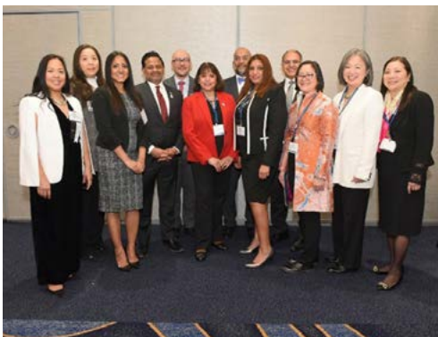
Members of the Asian American Judges Association of New York at the 2025 Judicial Section Luncheon