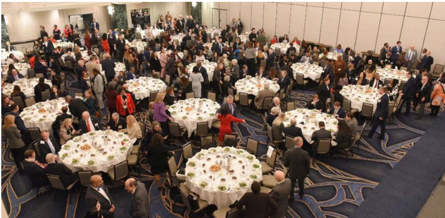
A packed house at the 2025 Judicial Section Luncheon