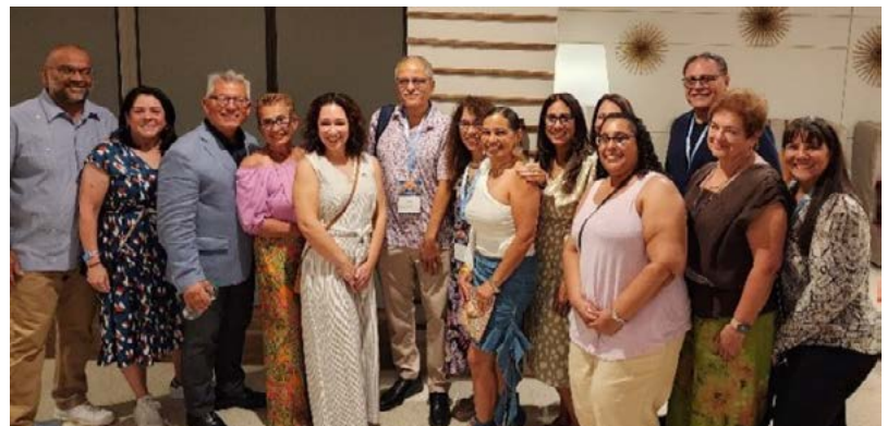
Members of the judiciary at the 2024 SOMOS Conference in San Juan, Puerto Rico