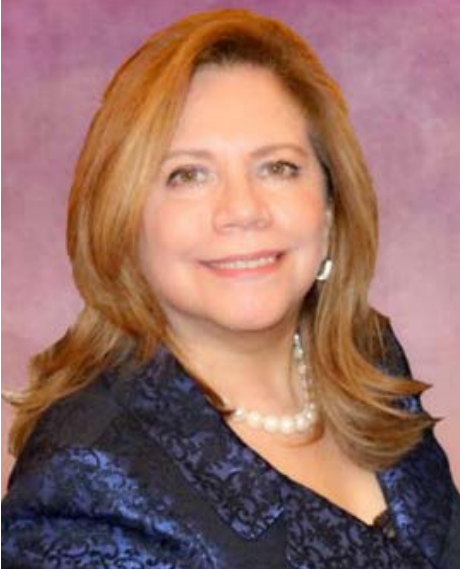
Hon. Carmen A. Pacheco Supervising Judge, Kings County Civil Court

Congratulations to Hon. Carmen A. Pacheco , who was appointed Supervising Judge of Kings County Civil Court on January 6, 2025.