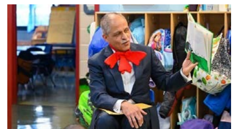
Hon. Rowan D. Wilson , Chief Judge of the State of New York and the New York State Court of Appeals