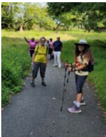
Paddleboard and hiking excursions at the AJSCSNY 2024 annual conference