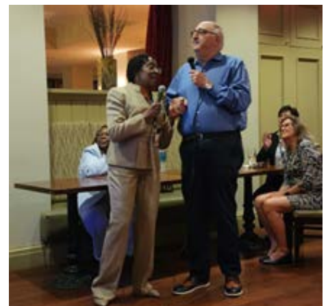
Supreme Court Justices and guests enjoy an evening of karaoke during the AJCSNY 2024 annual conference