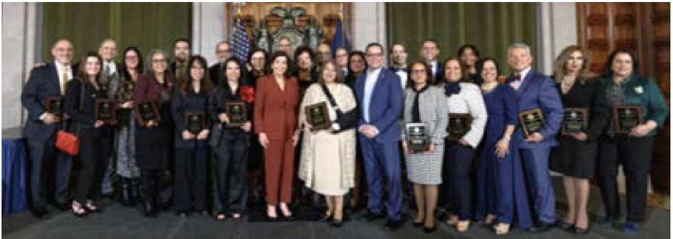
Latino Judges from across New York State honored by New York State Governor Kathy Hochul at a special "Justice in Action" reception held at the Executive Mansion in Albany, New York