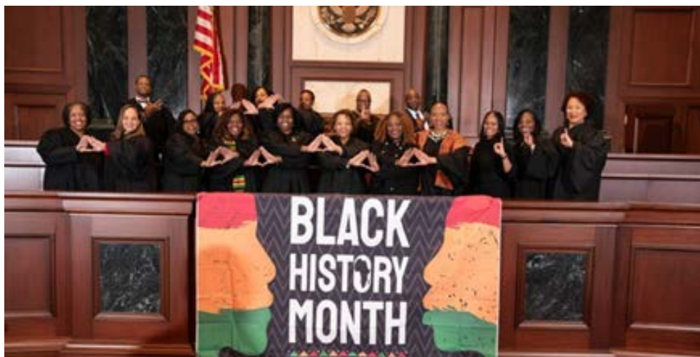
Members of the Divine 9 at the annual Celebration of Black Judges