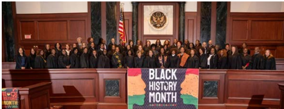
Members of the Judicial Friends Association at the 2025 Celebration of Black Judges

On February 4, 2025, the Judicial Friends Association in partnership with the Metropolitan Black Bar Association hosted its annual Celebration of Black Judges at the Daniel Patrick Moynihan Courthouse in Manhattan.