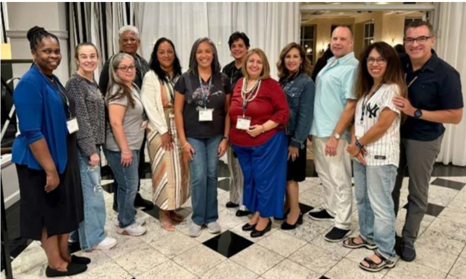
Members of the Latino Judges Association in attendance at the AJCSNY annual conference