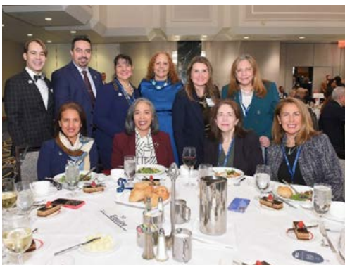
Members of the Latino Judges Association at the 2025 Judicial Section Luncheon