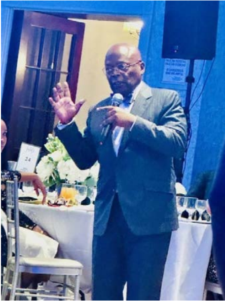
Hon. Alvin Yearwood