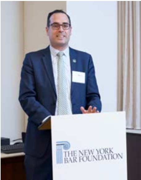
Hon. Adam Silvera , Deputy Chief Administrative Judge for New York City Courts, gives special remarks