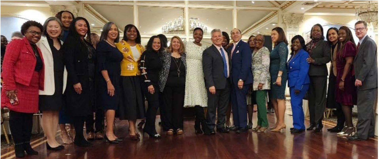
Members of the judiciary attend the holiday party of the Macon B. Allen Black Bar Association on December 17, 2024